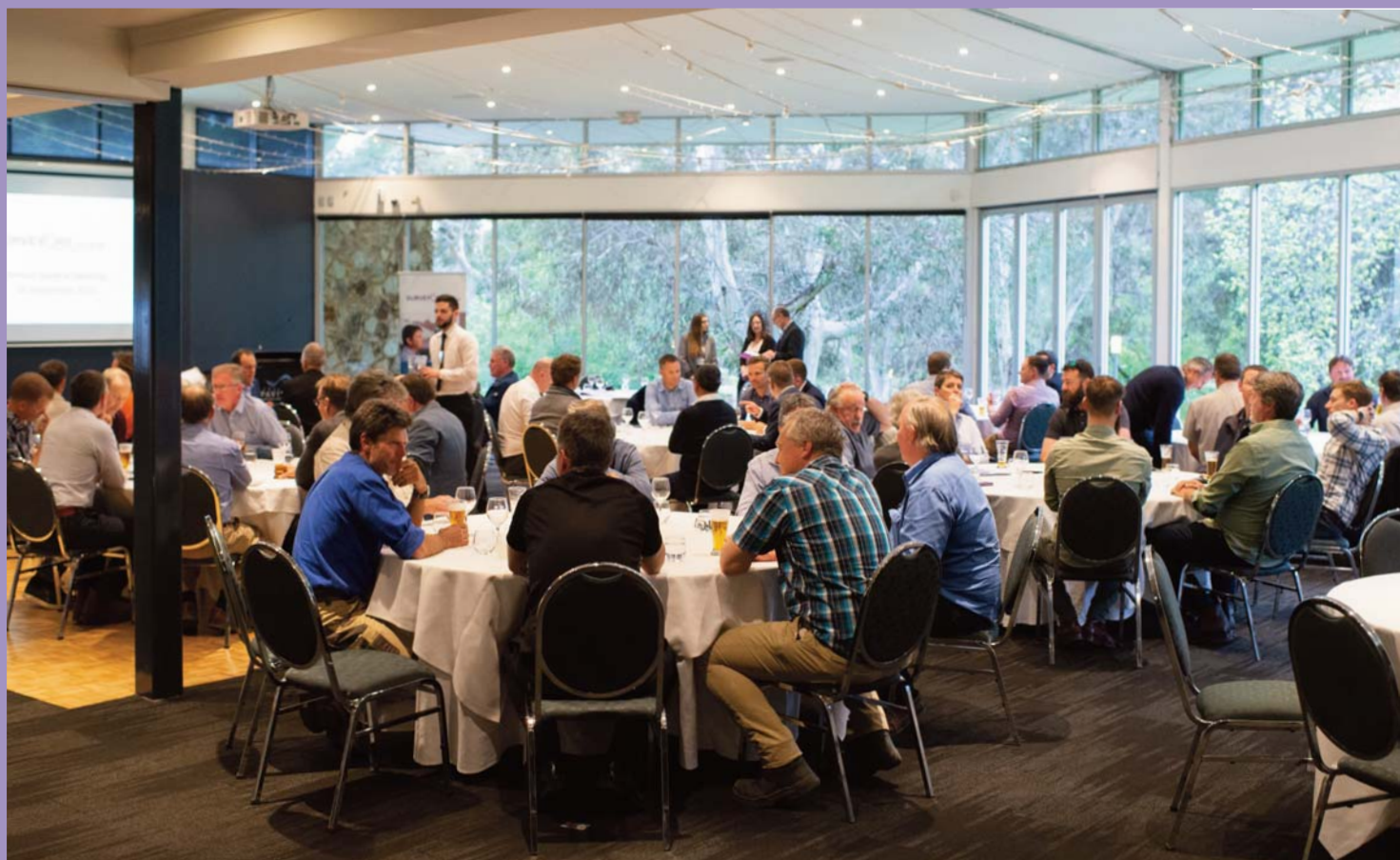
123 Licensed Surveyors gathered for the 2020 AGM at the Adelaide Pavilion